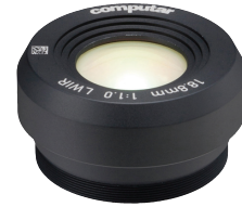
Zinc Sulfide Lens